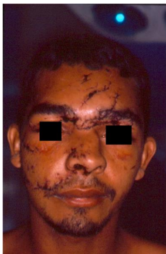
Figure 1: Gross deviation of the nasal dorsum.

reduction and fixation of the frontal sinus fracture. During the exploration of the wounds we found a piece of windshield glass over the nasal lateral wall measuring approximately 1,5 x 0,8 x 0,3 cm that was showed the nasal dorsum deviation. We proceed with the debridement, cleaning and fixation of the frontal sinus fracture and suture of the soft tissues (Figure 3). The postoperative period was uneventful and the patient was sent home on the second day after the procedure. On subsequent evaluations all the soft tissue and frontal fracture healed without suppuration or disturbed inflammatory reactions.