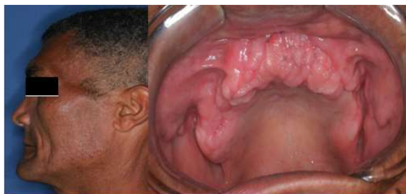
Figure 5 (A, B). Postsurgery. (A)- Profile and (B) – intraoral photo of patient after surgery, in which increased maxilla volume can no longer be noticed

The surgical specimen was placed in a flask containing formaldehyde at 10% and sent for anatomical-pathological examination at the Pathologic Anatomy Laboratory at the School of Dentistry at UFBA, together with the biopsy records and complementary exams. Antibiotics, anti-inflammatory and analgesic were prescribed. There were no complications during post-surgery period (Figure 5).