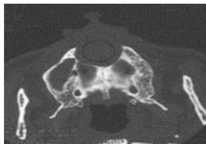
Figure 2. CT axial section, in which coefficient of pathologic area is being checked

However, because of its anatomical overlapping, the exact boundaries of the lesion and possible involvement of nasal cavities were not totally clear. Thus, a CT exam of the maxilla was requested. Two-dimensional axial, coronal and sagittal sections and three-dimensional reconstruction showed the lesion extension to nasal cavity and resorption of nasal septum. The largest dimensions of the lesion could be assessed, as well as its attenuation coefficient (10.7 UH), which showed high-protein liquid content, compatible to cystic liquid (Figures 2, 3/A, B).