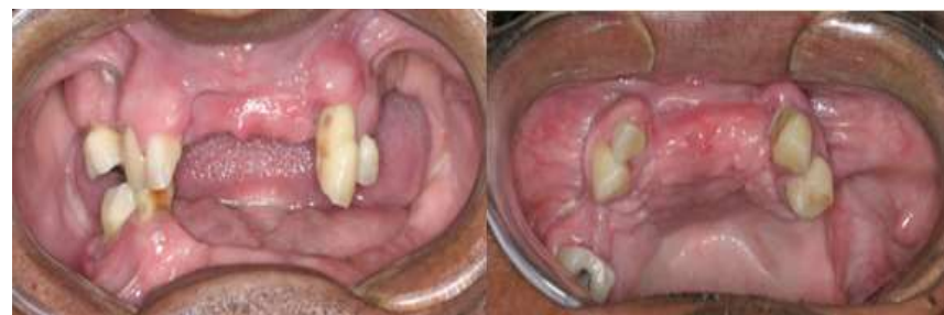
Figure 1 (A, B). Absence of teeth and gingival recession (A). Increased volume in the hard palate in the anterior maxillary region (B)

panoramic radiography was requested. It showed large radiolucent area on the middle maxillary line.