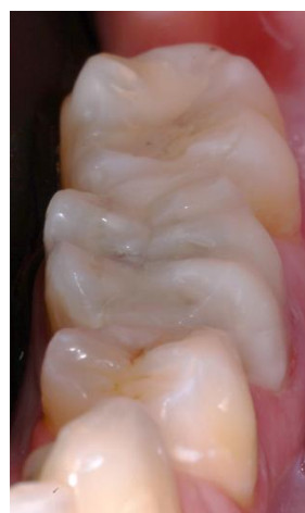
Figure 6: Final aspect of onlay restoration.

chosen was Bifix QM (VOCO, Cuxhaven GmbH, Germany). This resin cement was inserted directly into the inner face of the piece and seated in preparation; all excess was removed and still under digital pressure light curing was continued for 40 seconds on each face. To complete the restorative procedure (Figure 6), the occlusal adjustment was performed at the maximal intercuspal position and during jaw occlusion (laterality and protrusion) with rounded diamond tips. The edges of the restoration were finished with diamond tips F and FF, as well as the entire polishing protocol: high and low granulation abrasive rubbers for resin composite, felt abrasive disk pastes and finishing with silicon carbide brushes.