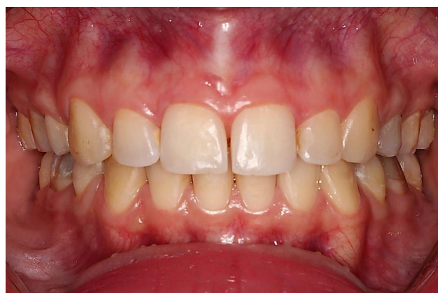
Figure 1: Initial aspect of buccal surface teeth.

A 28 years-old woman sought dental care at the Postgraduate Clinical of the Piracicaba Dental School of the University of Campinas. Anamnesis, medical and dental records were performed, as well as clinical assessment and diagnosis. The patient complained of a "fractured tooth" and that she "did not have a beautiful smile". No systemic disease was reported during the medical history, besides not being under medical treatment, not using any medication and not having any allergies. The patient's dental history consisted of orthodontic treatment between 15 and 18 years of age, and between 21 and 26 years of age, in addition, she had eight teeth extraction (15, 18, 25, 28, 35, 38, 44 and 45), by orthodontic indication. During the clinical examination, no changes in the oral mucosa and surrounding tissues were observed. The odontogram indicating unsatisfactory resin composite restorations on teeth: 22 (over content and lack of aesthetics, Class III mesial), 36 (lack of aesthetics, over contour, marginal pigmentation and irregular proximal contact, Atypical Class (mesio-occlusal-distal) and 46 (marginal fracture, Class II mesio-occlusal-distal); besides this, the patient had an inharmonious gingival contour and pigmentation in all teeth (Figure 1).