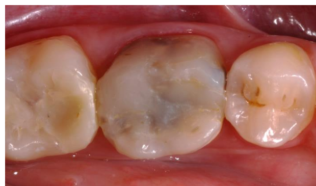
Figure 3: Restoration with bulk-fill composite.

The morphological reconstruction was lacking an adequate contact point and was very pigmented, due to the darkened colour of the dental remnant, it is important to note that this tooth was vital, so a conservative approach through adhesive techniques was chosen.