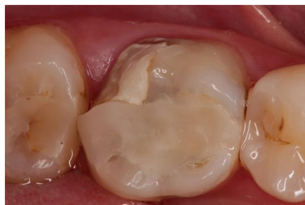
Figure 2: Initial aspect of tooth fracture.

involving teeth 12 to 23 was planned and performed in order to re-establish gingival harmony between the superior anterior teeth, defining the better gingival zenith. As a third step, dental bleaching was performed by bleaching with 35% hydrogen peroxide (Whitess HP, FGM, Joinville, SC, Brazil), using a dental office technique. Three sessions were performed at one-week intervals, and each session was applied three times, the whitening gel was applied on the enamel surface for a time of 15 minutes each. The last and main step of this case report was the indirect composite onlay on tooth 36 (lower left first molar): Previously, this dental tooth had an atypical resin composite (mesio occlusal distal buccal) restoration that had been fractured (Figure 2). The entire restoration was removed, and morphological reconstruction with bulk-fill resin composite was performed (Figure 3). Subsequently, the patient returned to continue the restorative treatment by means of a resin composite onlay.