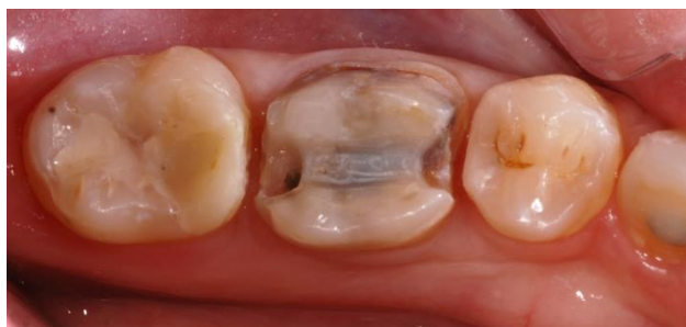
Figure 4: Preparation for onlay restoration.

proximal boxes with a rounded tapered diamond tip (3131) (KG Sorensen, Cotia, SP, Brazil); interproximal wear, in order to perform the dental separation with thin tapered trunk diamond tips (2200) (KG Sorensen, Cotia, SP, Brazil), with protection of metal strips in the proximal region; reduction of the cusps with rounded end tapered trunk diaphragm tip (4138) and finishing of all the walls with a multi-laminated drill bit 7664 (Komet Dental, Lemgo, Germany) (Figure 4).