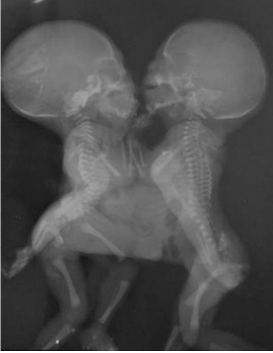
Figure 1: RX performed after the birth in intensive care unit.

as shown in Figure 1. The diagnosis indicated a severe congenital heart disease which was incompatible with the fetuses' lives and, although they did not have other alterations, it was decided to interrupt the pregnancy.