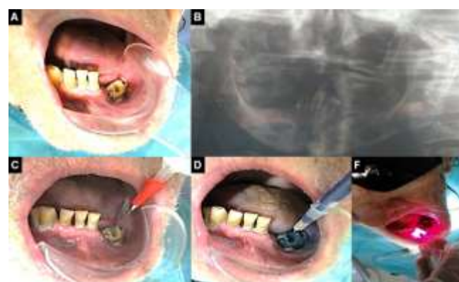
Figure 1. A) Intraoral exposure of necrotic bone in the left mandible. B) Panoramic radiography revealed a radiolucent lesion, diffuse in the mandible. C) Irrigation with 0.09% saline. D) Application of 0.01% methylene blue. E) aPDT.