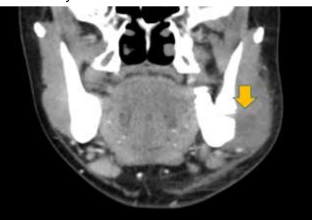
Figure 1: Coronal computed tomography showing a hypodense image in the buccal portion of the mandible.

the fluctuation develops. the strict observation of the patient is maintained and review of the treatment if there are indications of increase and dissemination of the infectious. All procedures performed in studies involving participants were in accordance with the ethical standards of the institutional and/or national research committee and with the 1964 Helsinki declaration and its later amendments or standards." ethical comparable Informed consent was obtained from participant included in the study.