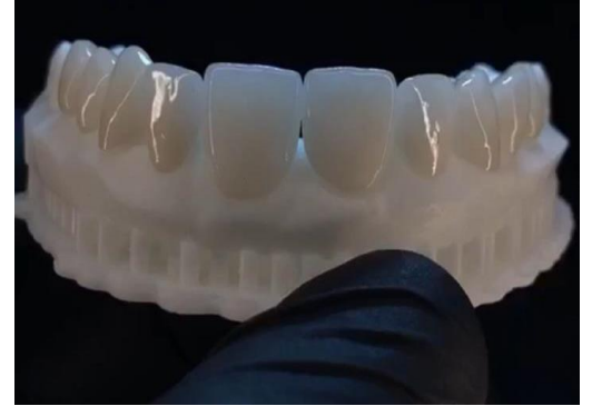
Figure 5: Milled CAD-CAM and a cut back make-up