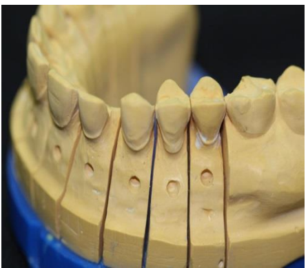
Figure 4: Model cutted to form matrices.