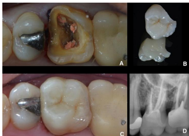
Figure 1- Endocrown group- A: removal of restoration and gingival retraction; B: Glazed specimen; C: Occlusal view of the cemented endocrown; D: Radiographic view.

Endocrown group – Well-defined cervical chamfered finish lines should be created to facilitate the impression and technical procedures, thus a 2-mm round-ended chamfer finish line was created along the margin using tapered inverted cone diamond burs, at high rotation and under cooling, against a 1:5 contra angle multiplier (S-MAX M95L- NSK). No filling was used, the space of the pulp chamber is included in the preparation (Figure 1).