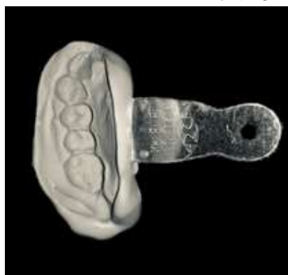
Figure 1: Partial molding of interest region.

For the technique, entitled “Simulation of Dental Preparing of Plaster Model”, is necessary partial molding of the region, using dental material with dimensional stability (Figure 1).