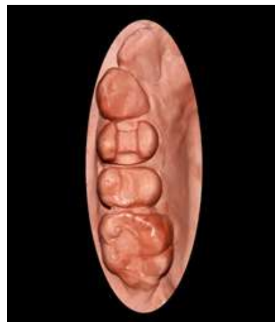
Figure 3: Preparing of model obeying the biomechanical principles agreed during the professor's orientation.

Subsequently, preparing is discussed together with professor and auxiliary colleague. After all the considerations, each student reproduces the preparation in their model, intact, now obeying the biomechanical principles, agreed during the professor's orientation (Figure 3).